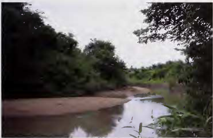
Fig. 4. Gallery forests at the Zou River, southern Benin.